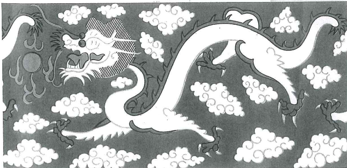
Ornamental Chinese dragon.