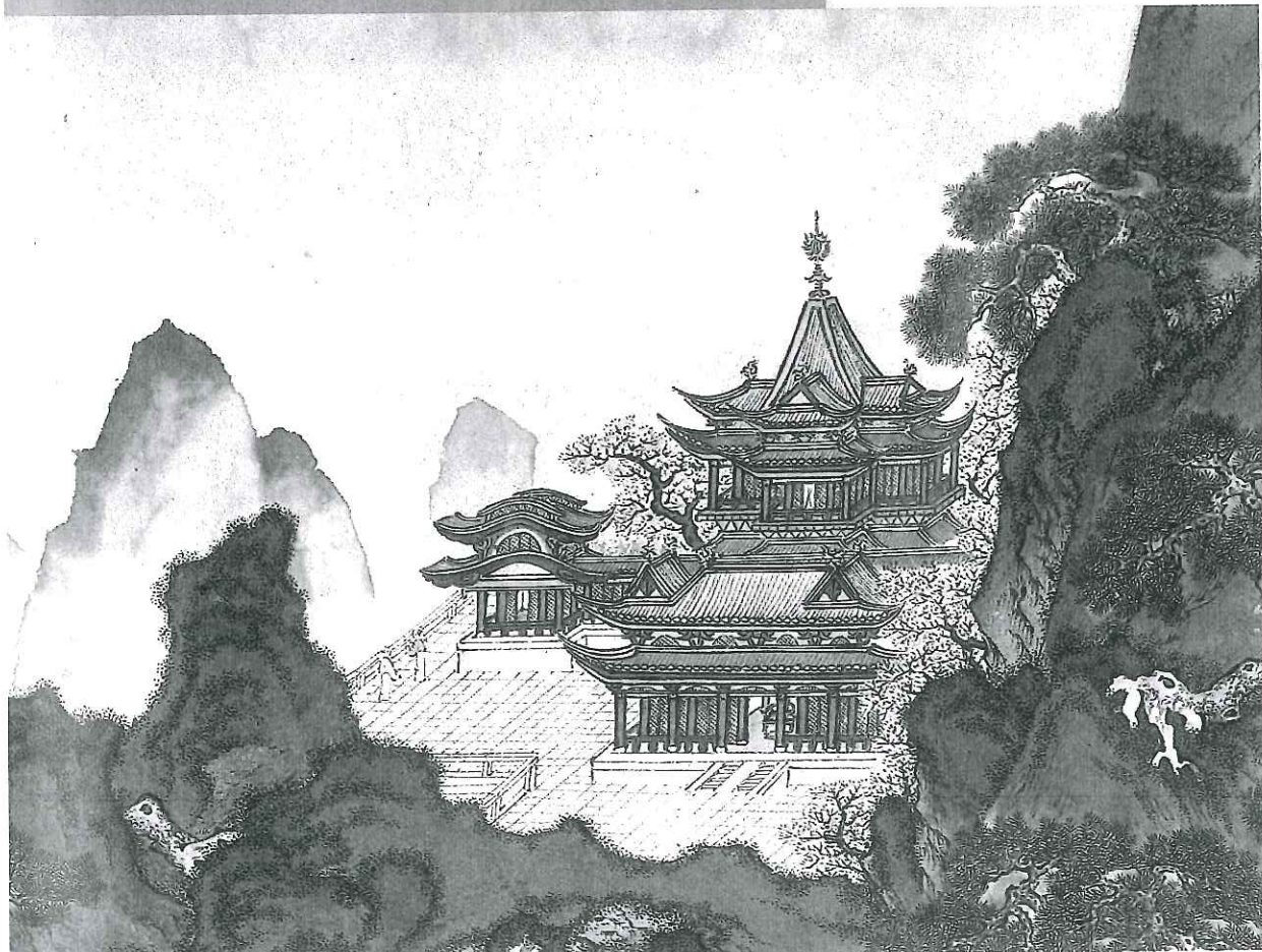
Green Landscapes by Li Qing.