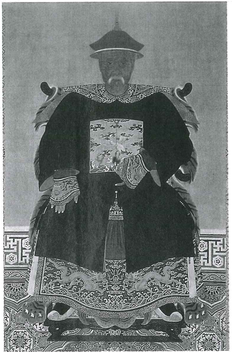
Ancestor Portrait (late 17th or early 18th century) by Chinese School. Private collection.